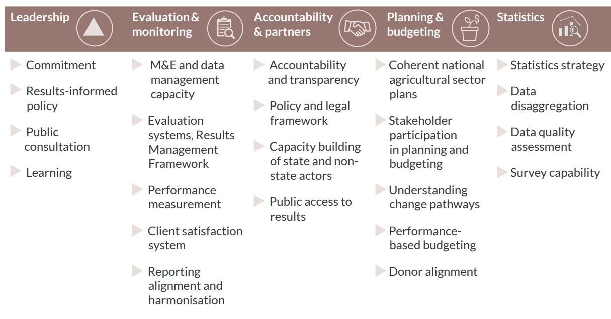
Table 1: RBM capacity areas self-assessed as part of the AG-Scan process

The International Fund for Agricultural Development (IFAD) funds the AVANTI Initiative (known simply as 'AVANTI'), which uses country-specific 'AG-Scans' to better understand the in-country strengths and opportunities for improved RBM in the agriculture and rural development sectors. The AG-Scan process places leadership at the heart of creating a results and learning culture within the institutions responsible for agriculture and rural development. The process adopts a participatory (workshop style) approach and explores five broad areas, shown in the table below.