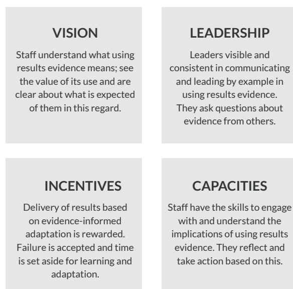
Figure 2: Organisational levers to create a learning culture